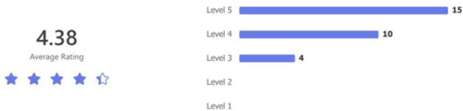
Graph 1: Lesson Rating of the Respondents about the General Experience of the Lesson

Students’ experiences suggest that citizenship education provided a meaningful framework through which economic concepts were understood in relation to real-world social responsibilities. Rather than perceiving lessons as abstract or purely academic, students described how the integration of citizenship themes enabled them to connect economic knowledge with societal impact. As one participant shared, understanding economic issues allowed them to “see how decisions affect people in society,” reflecting an emerging awareness of the broader consequences of economic actions. Participants’ narratives indicate that classroom discussions—particularly those centered on global peace and leadership—served as spaces for reflection and dialogue. Through these engagements, students experienced learning as an opportunity to examine their roles within